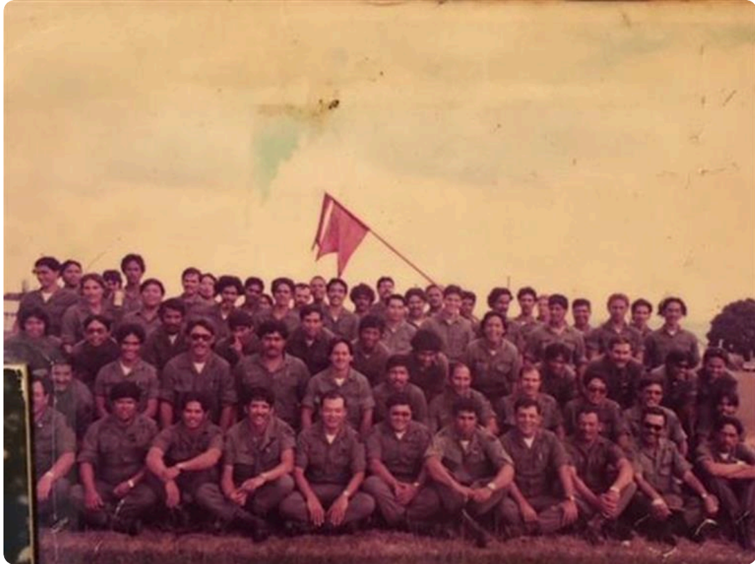
1st 487th C Battery FA Back in the 70's